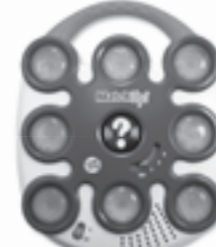
MATCH UP!™ Concentration Game

Listen, remember and match! 3 in a row wins.