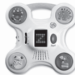
LETTER CRAZY!™ Phonics Game

Bop around! Learn letters and letter sounds.