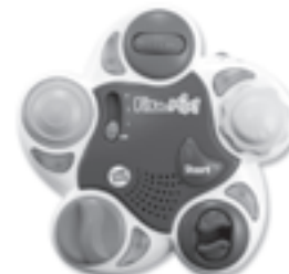
FIX THE MIX!™ Sequencing Game

Twist, roll, push, squeeze and spin! Get the sequence right to win.