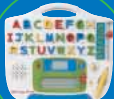
Phonics Writing Desk™ 4+ years

The LeapFrog® Birthday Party Pack is designed to expand the role-play experience of the LeapFrog Shopping Cart, while introducing new, preschool-appropriate skills.