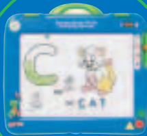
Imagination Desk® Learning System 3+ years