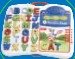
Learn to Read Phonics Desk® System 3+ years