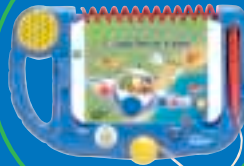
My First LeapPad® Learning System 3+ years