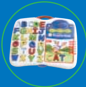
Learn to Read Phonics Desk® System 3+ years