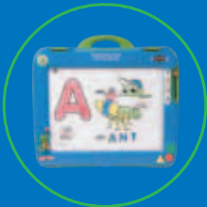
Imagination Desk® Learning System 3+ years