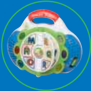
Phonics Radio 18+ months