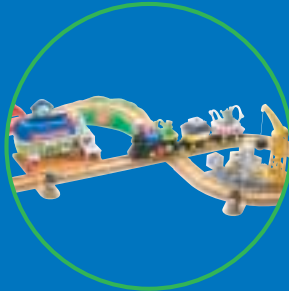
Leap's Phonics™ Railroad 2+ years