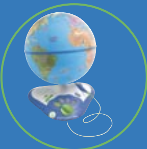
Junior Explorer Globe 3+ years