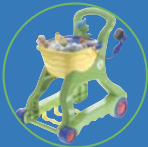
LEAPFROG™ Shopping Cart 2+ years