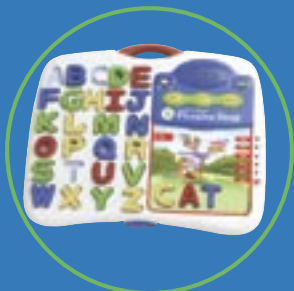
Learn to Read Phonics Desk™ System 3+ years