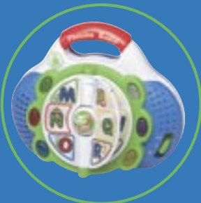
Phonics Radio 18+ months