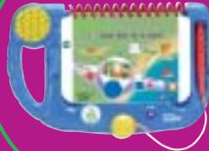
My First LeapPad™ Learning System 3+ years