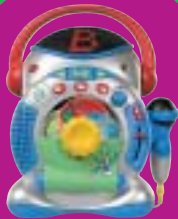
Learning Screen™ Karaoke 4+ years