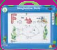
Imagination Desk™ Learning Activity Center 3+ years