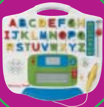
Phonics Writing Desk™ 4+ years