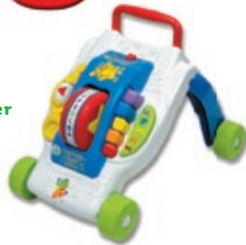
Learning Band™ Walker