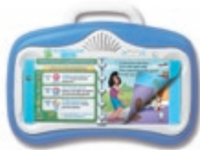
LittleTouch™ LeapPad™ LEARNING SYSTEM

More early learning toys from LeapFrog Baby!