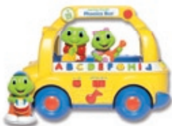
Learning Friends™ Phonics Bus™ Vehicle