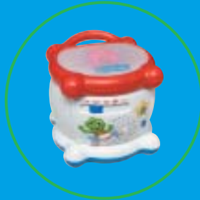
Learning Drum 6 months +