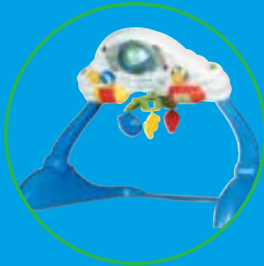
LeapStart™ Learning Gym Birth +