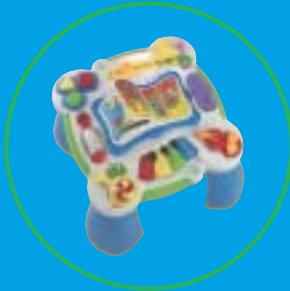
LeapStart™ Learning Table 6 months +