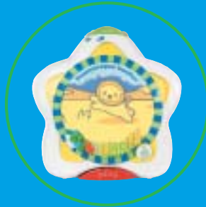
Dreamscapes™ Soother Birth +